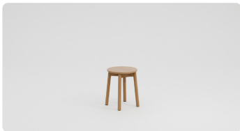
FB-LWST 320 W x 370 D x 460 H (SH 460)