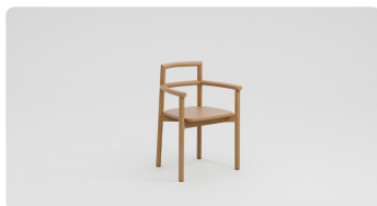
FB-CH_ARMS 440 W x 570 D x 800 H (SH 460)