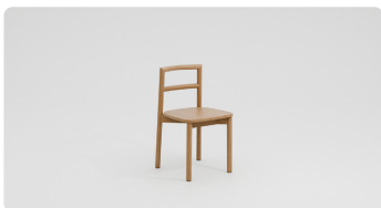
FB-CH 440 W x 500 D x 800 H (SH 460)