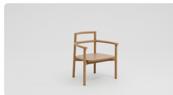
FB-LG_ARMS 680 W x 600 D x 760 H (SH 400)