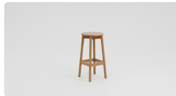
FB-HLST[75] 360 W x 370 D x 750 H (SH 750)