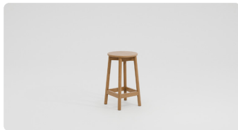
FB-HLST[65] 345 W x 370 D x 650 H (SH 650)